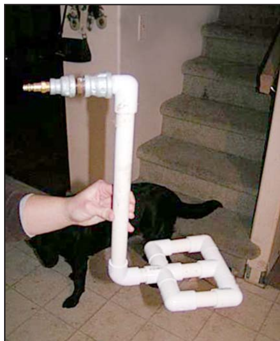
This is a homemade unit to clean eggs with water and bubbles. The unit is made with three-quarter-inch PVC pipe and drilled with a 3/32-inch bit.

Producer Mike Geubert described how to make a similar system on the farm. This can save on costs, especially if one already owns an air compressor. The bubbler system can be made with PVC piping with holes drilled throughout the base and an air coupler to connect to the compressor. The regulator on the compressor can be used to adjust the pressure to 10 to 5 pounds per