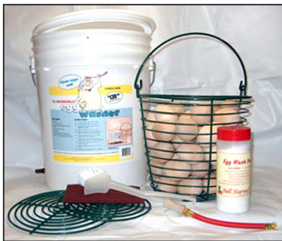
The Incredible Egg Washer uses air bubbles and water to clean shell eggs.

offered by The Incredible Egg Washer Co., Nasco, and other suppliers.