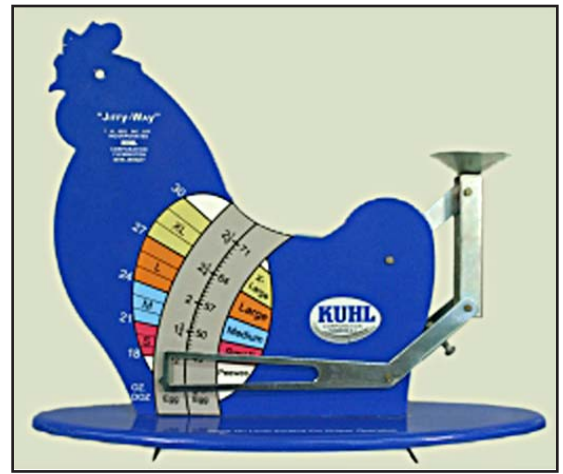
The Jiffy Egg Scale is an inexpensive gravity-operated egg scale.

For small-scale grading, gravity operated scales can be found for less than $70. They are available through Kuhl, Nasco, Rochester Hatchery and other suppliers.