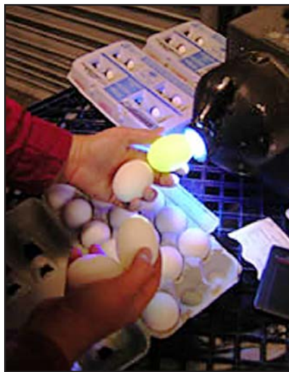
Candlers help ensure the interior quality of eggs.

According to Colorado State Extension, “a suitable light can be handmade by cutting a 1.25-inch diameter hole in the end of a coffee can. Insert a light bulb fixture through the lid, using a 40-watt bulb. View the interior of the egg by holding the large end up to the hole cut in the bottom of the can. As the light passes through the egg, twirl the egg several times. If blood spots are present, you will see them” (Geiger, 1995). Another low-tech way to candle is by taping a 3-inch length of empty bath tissue paper tube to a flashlight. Suppliers such as Nasco, Kuhl and Rochester Hatchery offer hand candlers.