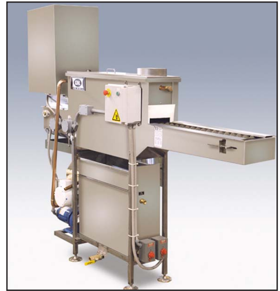
The EBEW 1-5 cleans eggs through a pressure spray wash and sanitizer spray.

Kuhl Corp. offers the EBEW 1-5, which processes from one to five cases an hour, or from 360 to 1,800 eggs. A recycled spray is used to clean eggs. Eggs are rotated on rubber rollers during cleaning and then pass through a sanitizing spray. A grader or farm packer can be attached.