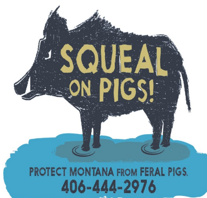
Figure 3. Feral Swine

If you are interested in learning more about feral swine, the Department, along with MISC and USDA APHIS WS is holding a Feral Pig Summit in Billings on November 15. Look for additional detail in the coming weeks! ✂ By Tahnee Szyman-ski, DVM