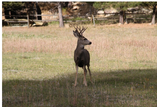
Figure 2. White Tail Deer

The MVDL is committed to improving and expanding its diagnostic testing services into the future and looks forward to being able to provide these CWD testing services for Montana in the coming months. ✂ By Gregory Juda, PhD.