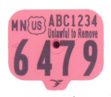
Tag Piece B (Back of ear)