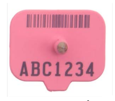
Inside of Tag Piece B (Not in View while tags is on the pig)