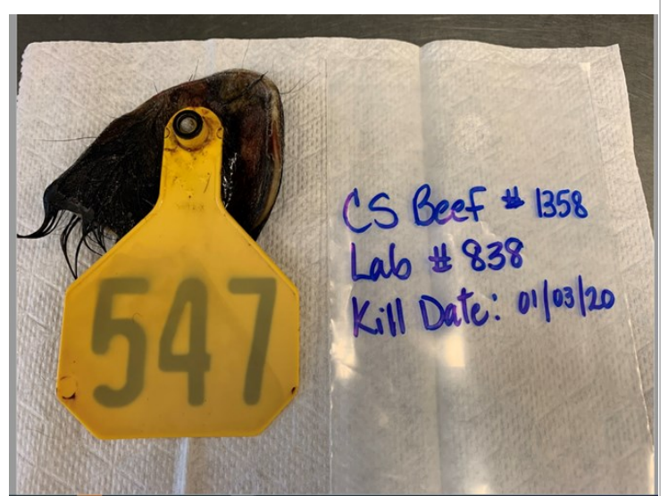
Figure 2. ID collected at slaughter.