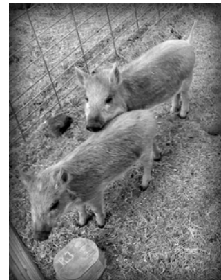
Texas origin feral swine illegally imported into southwestern Montana.

You may find an informative brochure by USDA here: http://goo.gl/9802W . ♪ mz