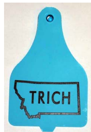
Trichomoniasis tags changed to BLUE on Sept 1st.

The comment period on the proposed change will remain open until July 18 . These rules are available for your review on the http://goo.gl/EpFz9 . Please take a moment and look over the proposed changes and submit comments to our office. ✉ By Tahnee Szymanski, DVM