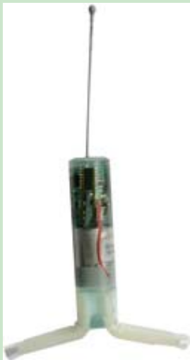
Vaginal Implant Transmitter such as the one implanted into seropositive, pregnant elk in the FWP live-capture study.