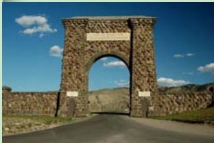
Roosevelt Arch at Yellowstone National Park entrance