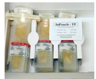
InPouch Trichomoniasis Transport Media